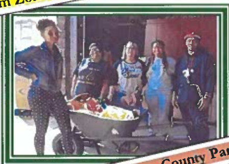
Wilson County Parents