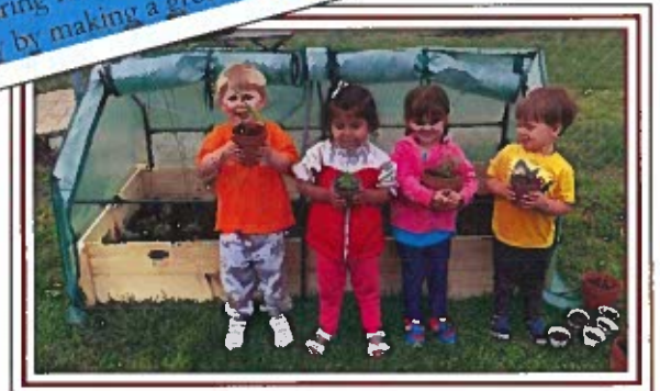
Ashland City's BHS classroom preparing for their gardening study by making a greenhouse.

Teachers used a variety of strategies to teach the children in their class. They engaged students in meaningful conversations, followed their interests in study planning, and allowed them to investigate by providing learning experiences indoors and outdoors. Our research-based curriculum allows teachers to inspire children's learning while building their confidence, creativity, and critical thinking skills. They are also able to promote discovery and inquiry with opportunities for children to think critically and develop process skills with rich, hands-on investigations of relevant and interesting topics in the classroom. The pictures below give some examples of how this looked when teachers led the gardening study.