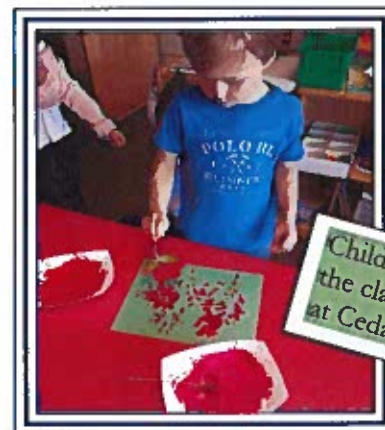
Child painting with a flower for the classroom's gardening study at Cedarwood Head Start.