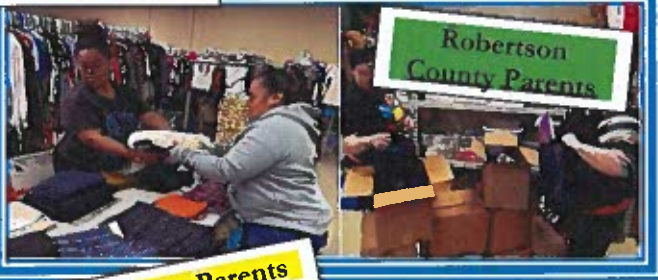
Robertson County Parents