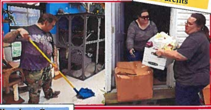
Cheatham County Parent